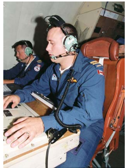
Usability Testing & Evaluation